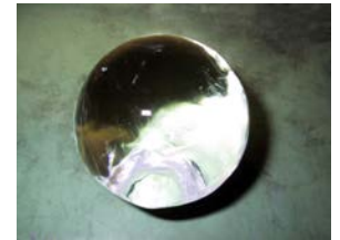
Softly stamping out sphere ice from plate only after scraping with IB6