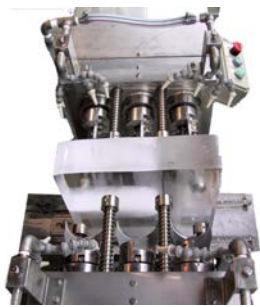
Placing ice plate Simple operation of pressing start button after placing ice plate