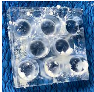
Cycle time of one operation with 6 or 8 sphere ices is 20 seconds.